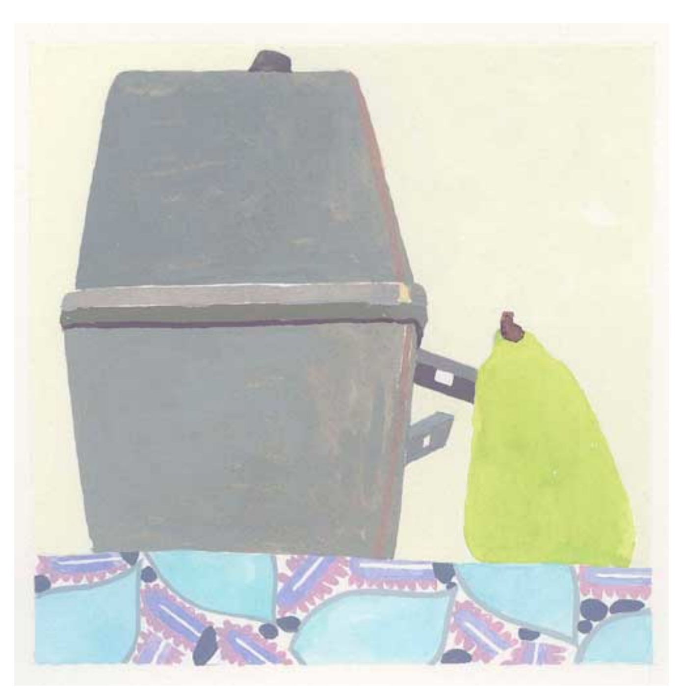
Yaddo Lunches, watercolor