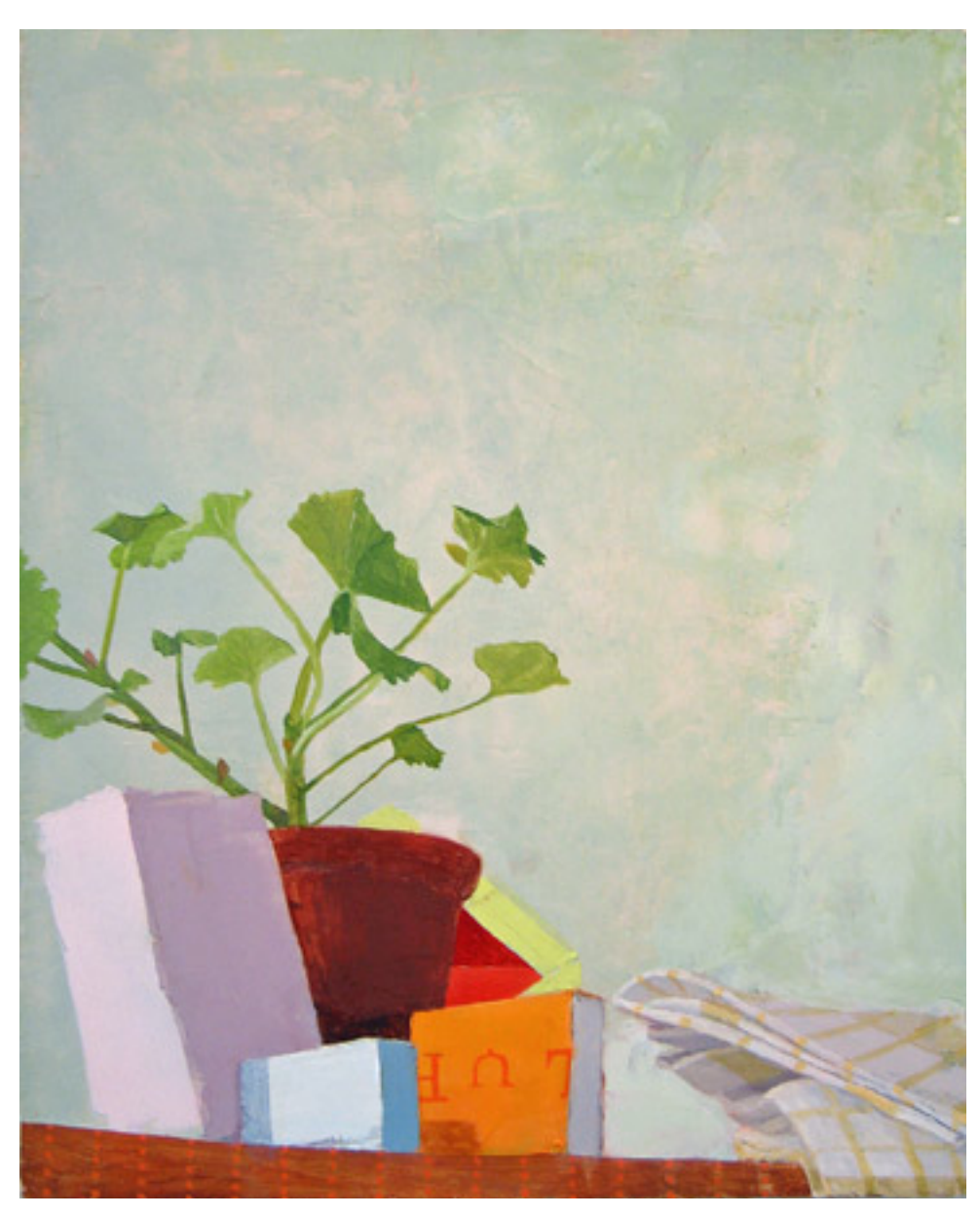
{\it Still Life With Common Objects}