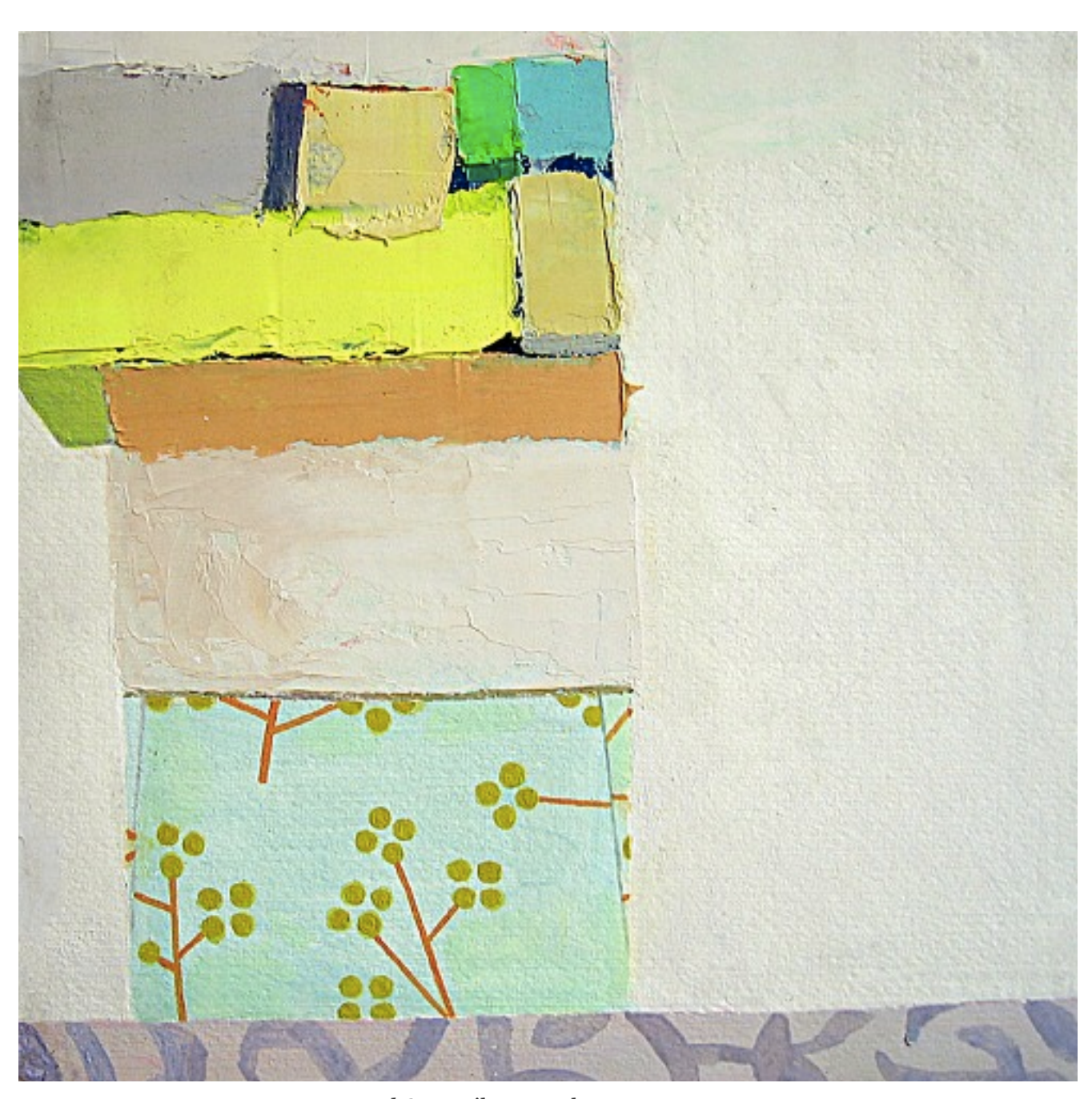
Up and Over, oil on panel, 2013