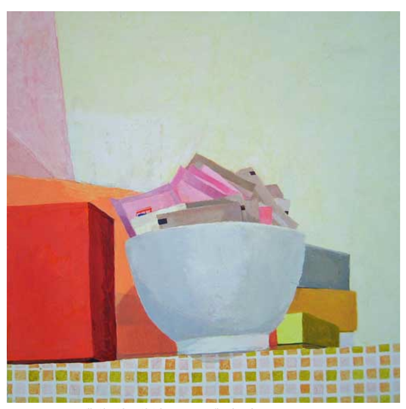
Still Life with Artificial Sweeteners, oil on board, 2010