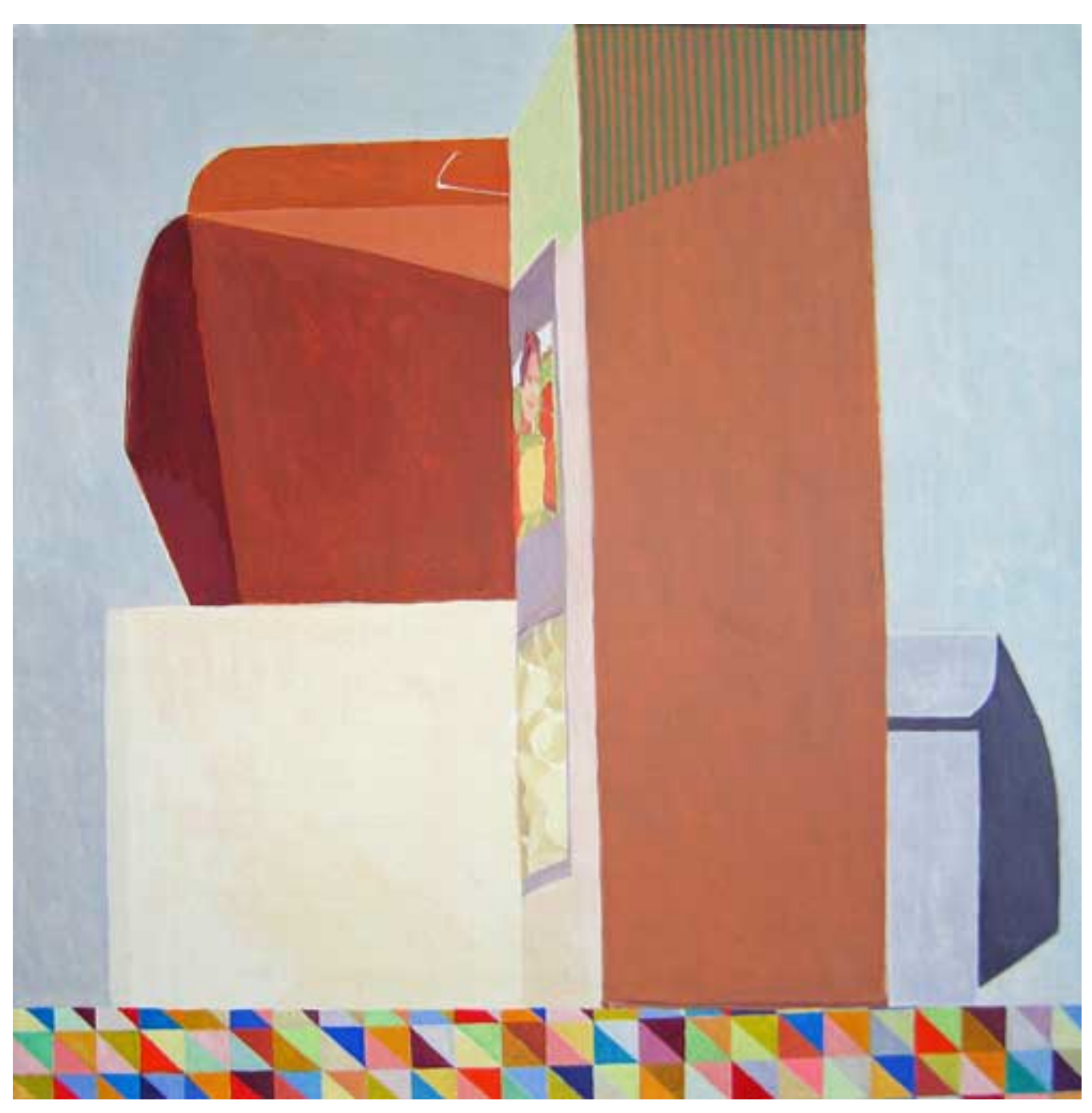
Still Life with Pasta, oil on board, 2010