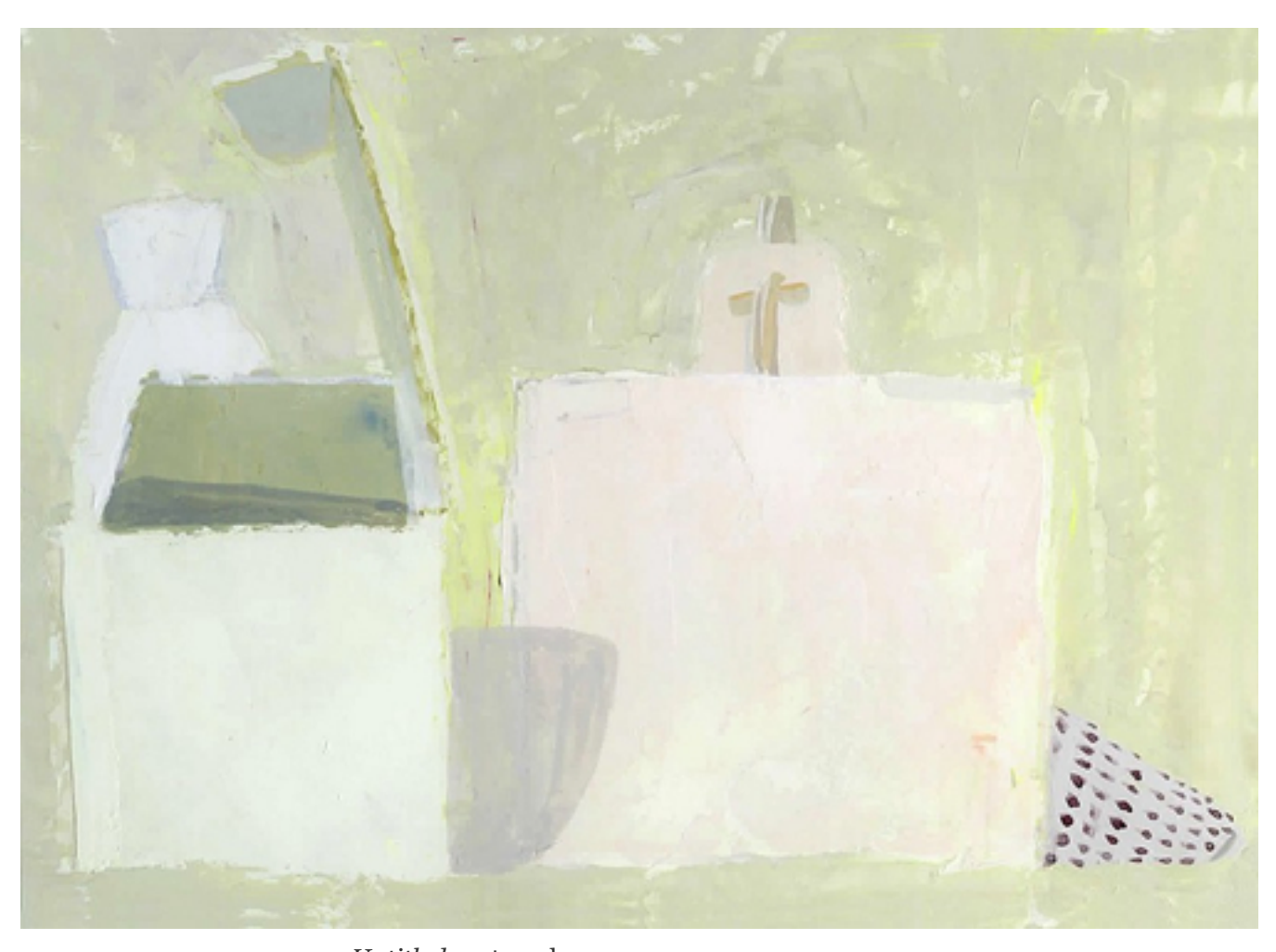
Untitled, watercolor on paper, 2013