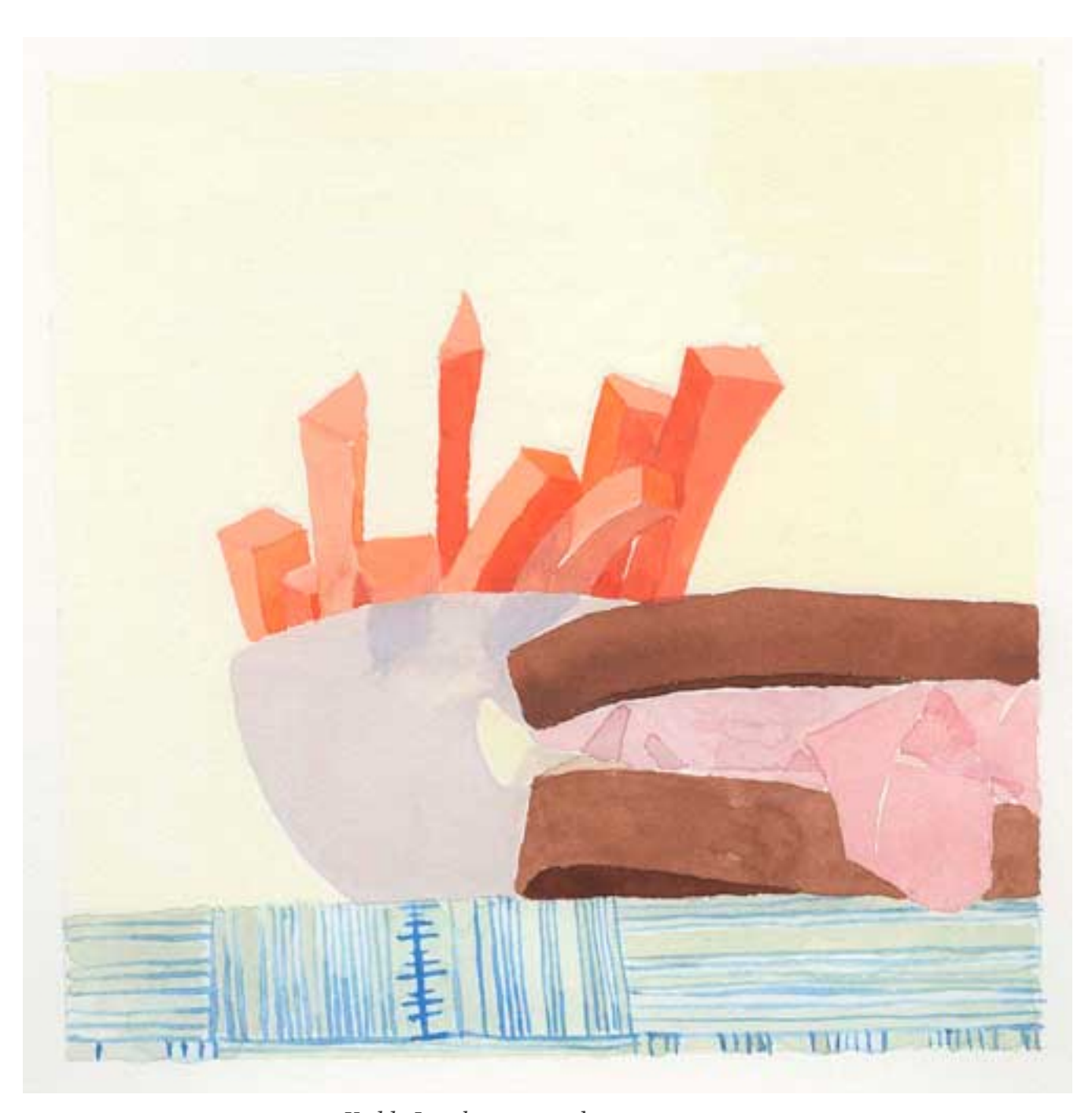
Yaddo Lunches, watercolor