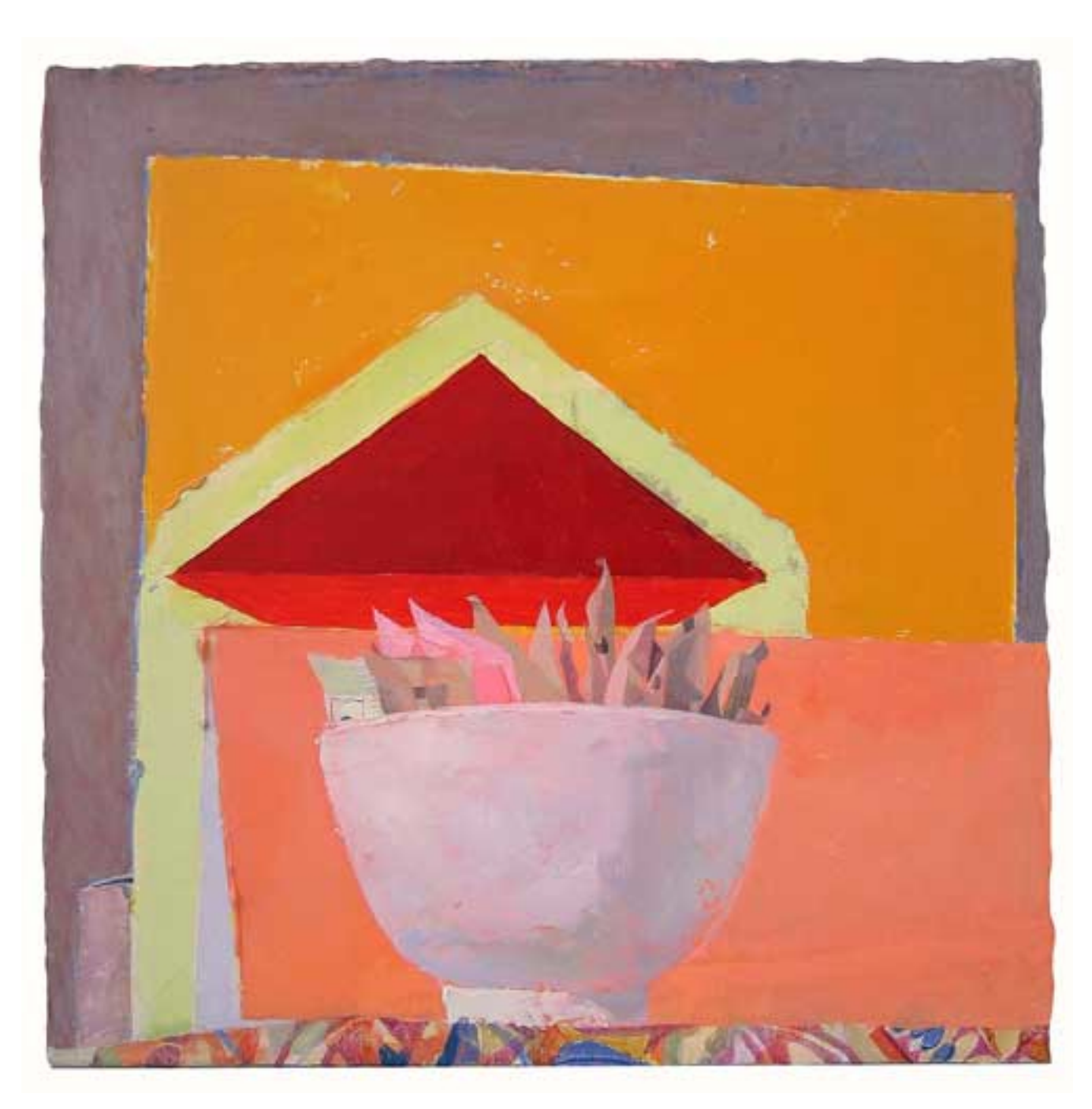
Still Life with Sweet and Low #1, oil on linen, 2010