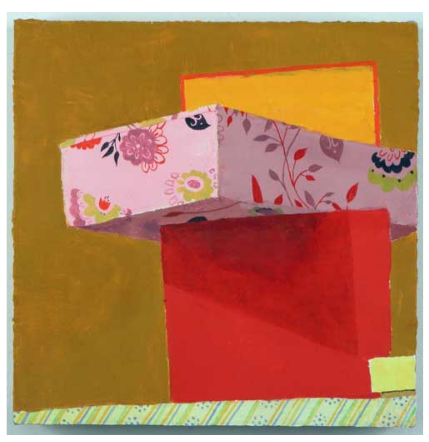
Still Life with Open Box #1, oil on linen, 2006