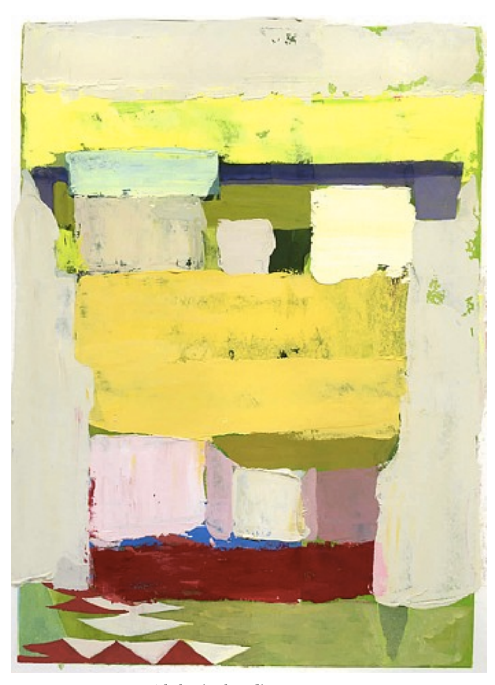
Untitled, mixed media on paper, 2013