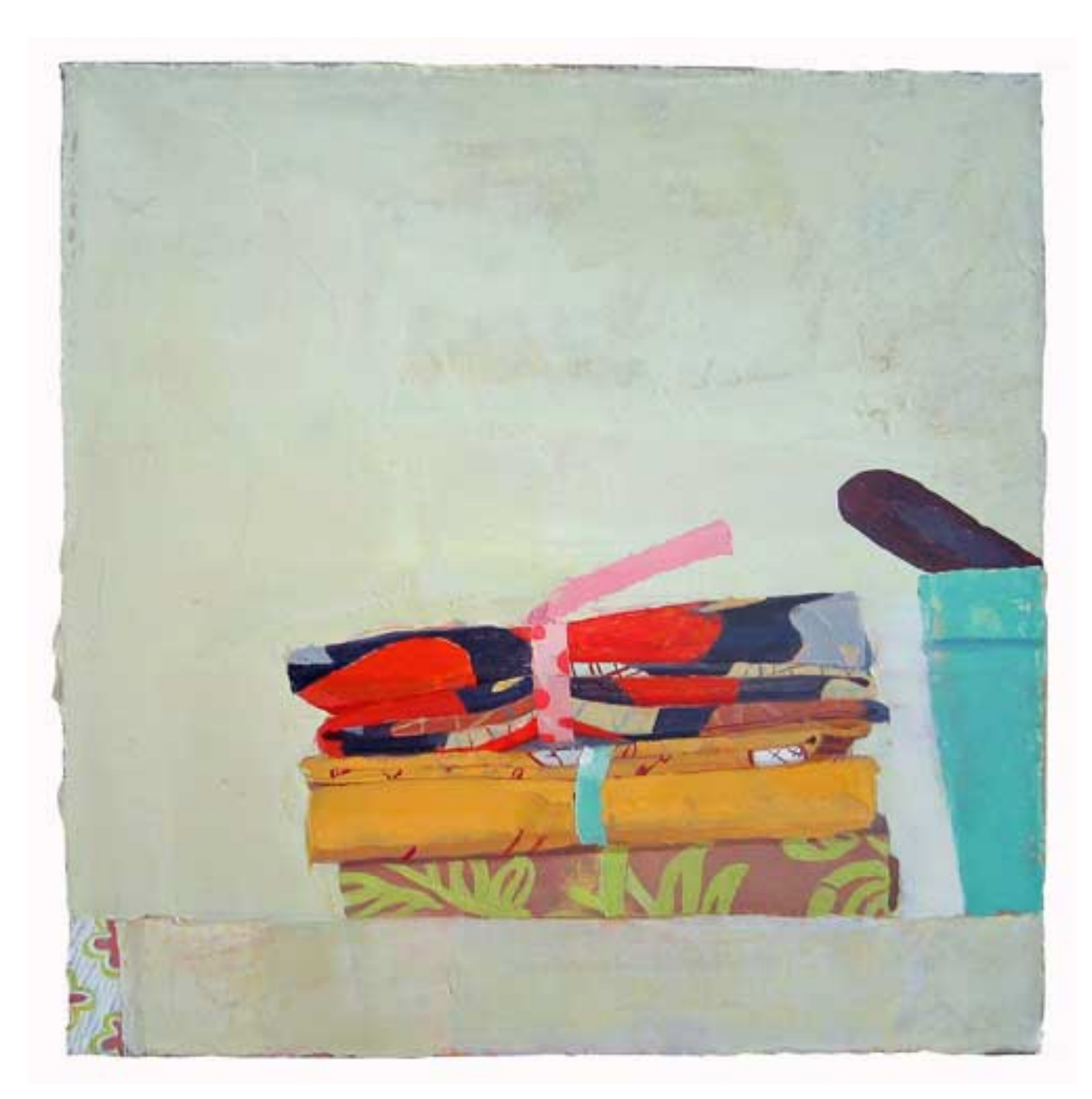
Still Life with Bundles, oil on linen, 2011