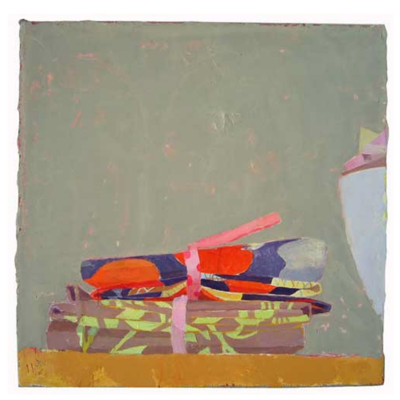
Still Life with Two Bundles, oil on linen, 2010