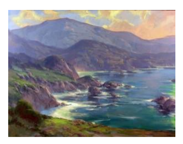
Guidance, oil, 48 x 54

"I consider it an honor to carry on the grand tradition of painting the American landscape. What makes landscape painting so inviting and relevant to our modern society is that as we become overwhelmed by our video games and traffic jams, I feel people need that connection with God's creation. That is why someone works a long week and then goes for a hike on the California Coast—to reconnect. In the same way, someone can view a landscape painting and it feeds their soul. The scene interpreted in GUIDANCE is a place I visit often, being just a short drive south from my studio in Carmel."