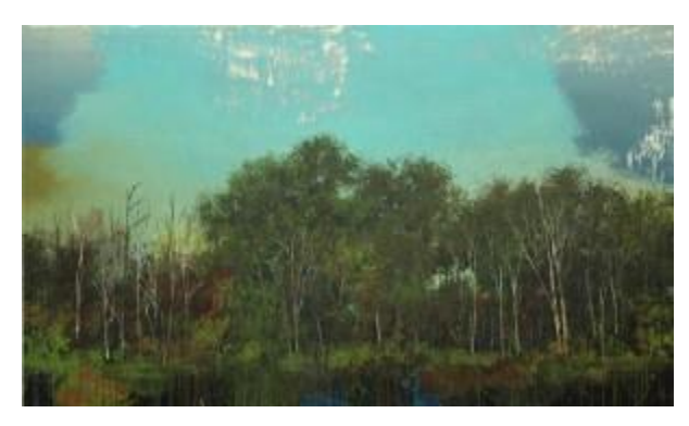
Arrangement, mixed media, 36 x 60

"My formal training is in sculpture, so I have always been interested in the physicality of the paint as material in itself. I sand, grind, and scour the layers of painted surface, revealing the process of time. With chisels, I etch the layers of plywood, to suggest either a calculated tree or a damaged surface. The paint is haphazardly applied initially, then refined with detail. It is the play between control and intuition that makes these landscapes as much about material and process as about the image. Landscapes I'm familiar with are generally less than spectacular in their topography. It's the idiosyncrasies that convey the nuances of the place. Meaning is found within the small branches, the meandering brook, or the inconsistent density of foliage."