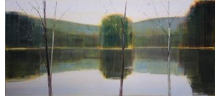
2010, VI.II, oil, 34 x 76

"This is one of a series of paintings that are variations on iconic themes: a bend in a river, a point of land, an island, and always a broad expanse of reflective water. These provide diffuse, generalized middle ground and background planes against which a few sparse trees play out a foreground rhythm. This landscape structure offers an entry point. Meanwhile, the surface confronts the viewer with the marks made by the tools that created the scene: house-painters' brushes, drywall tools, and scrapers. In this way the painting is revealed to be a construction. A Chinese saying describes the experience: 'First you see the hills in the painting, then you see the painting in the hills.'"