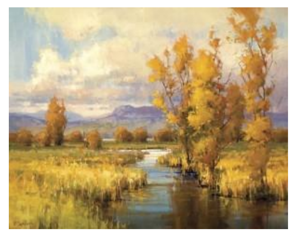
Amber Reflections, oil, 24 x 30

American Legacy Gallery, Kansas City, MO; Galleries West Fine Art, Jackson, WY; Rive Gauche Art Galleries, Scottsdale, AZ; Strecker-Nelson Gallery, Manhattan, KS; <a href="https://www.kimcasebeer.com">www.kimcasebeer.com</a>.