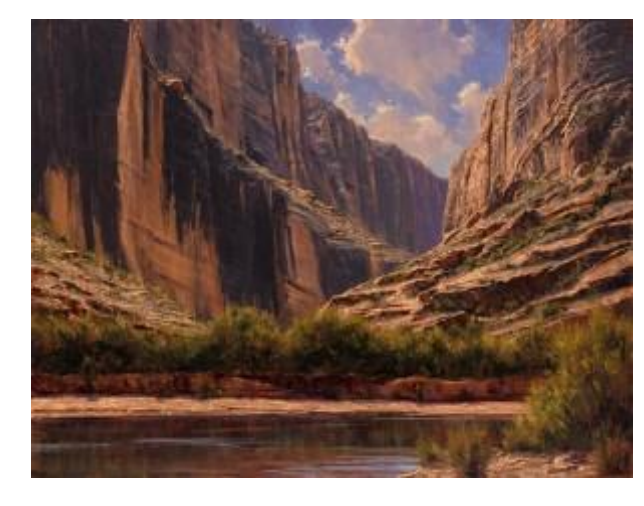
Santa Elena, oil, 38 x 50

American Miniatures, Settlers West Galleries, February 12. Panhandle-Plains Invitational Western Art Show & Sale, Canyon, TX, February 26-March 27. Night of Artists, San Antonio, TX, March 3-4. NatureWorks Art Show & Sale, Tulsa, OK, March 4-6.