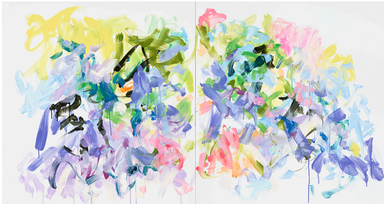
Hints of Gladness , 2014, Oil on canvas, 38 x 72 inches