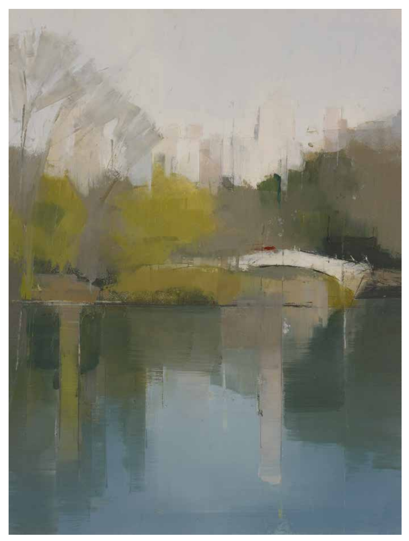
Fig. 17: Lisa Breslow. Central Park Lake 3 , 2012. Oil and pencil on panel: 16 x 12 inches.