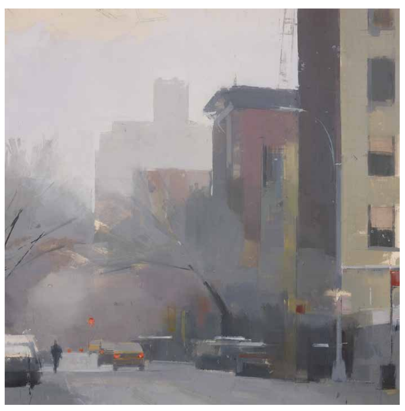
Fig. 15: Lisa Breslow. West Village, Greenwich Street, 2012. Oil and pencil on panel: 24 x 24 inches.