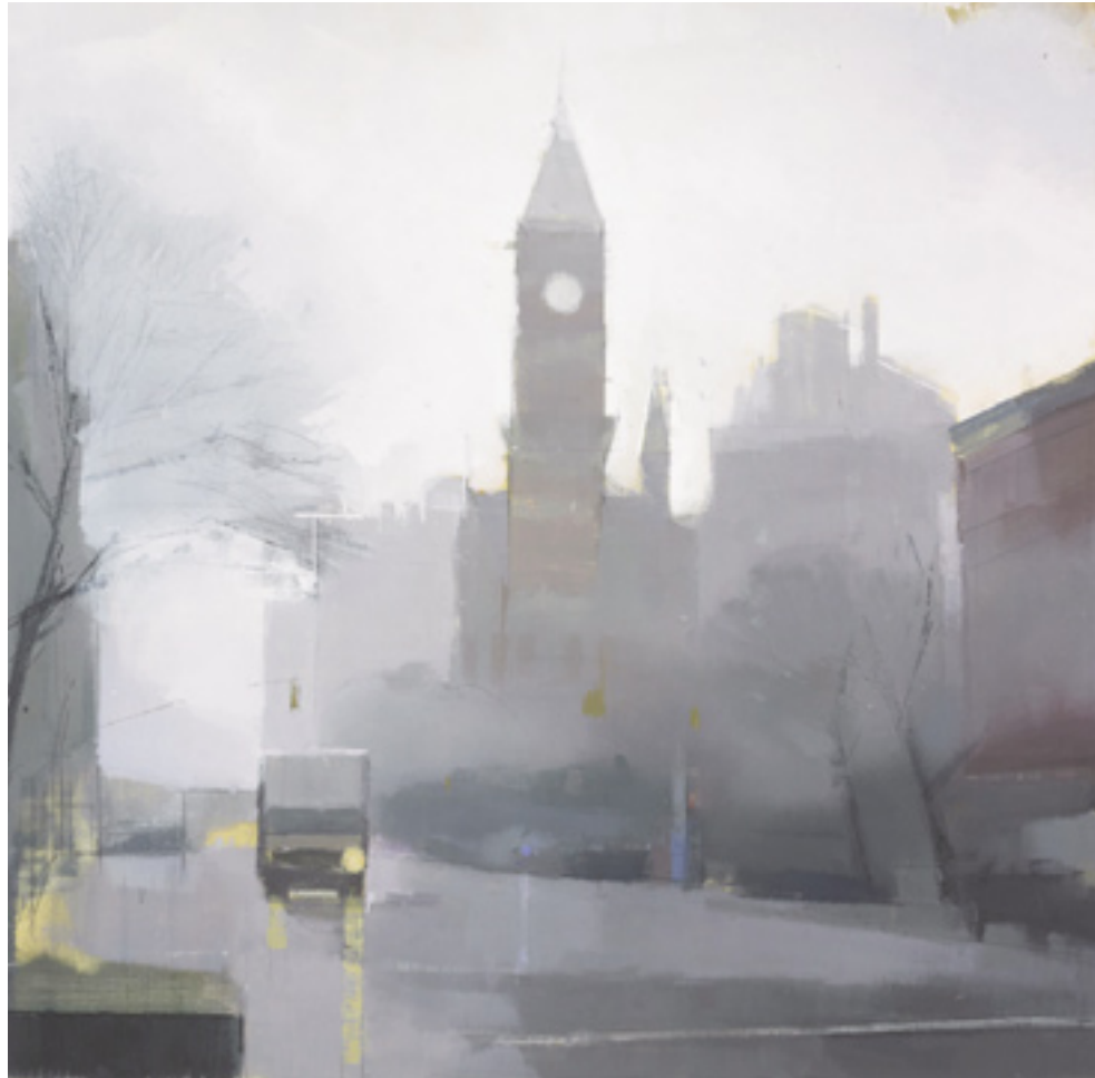
West Village Street, Winter's Day 1, 2009 , Oil and pencil on panel, 24 X 24 inches