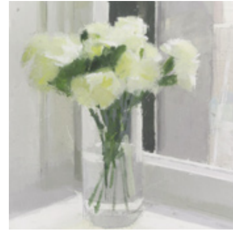
Flowers in a Glass 1, 2010 , 12 x 12 inches, oil and pencil on panel

One day not long ago, Breslow bought a few flowers at a corner bodega and set them in a glass in her studio window. And painted them. And then again, and some more. She affirms, "It becomes a way of binding nature and the city, of bridging