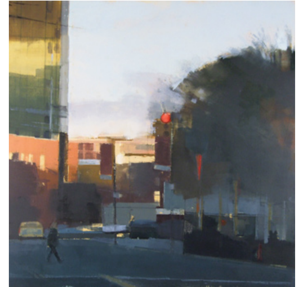
Long Island City Street #2, 2008 , Oil and pencil on panel, 20 X 20 inches