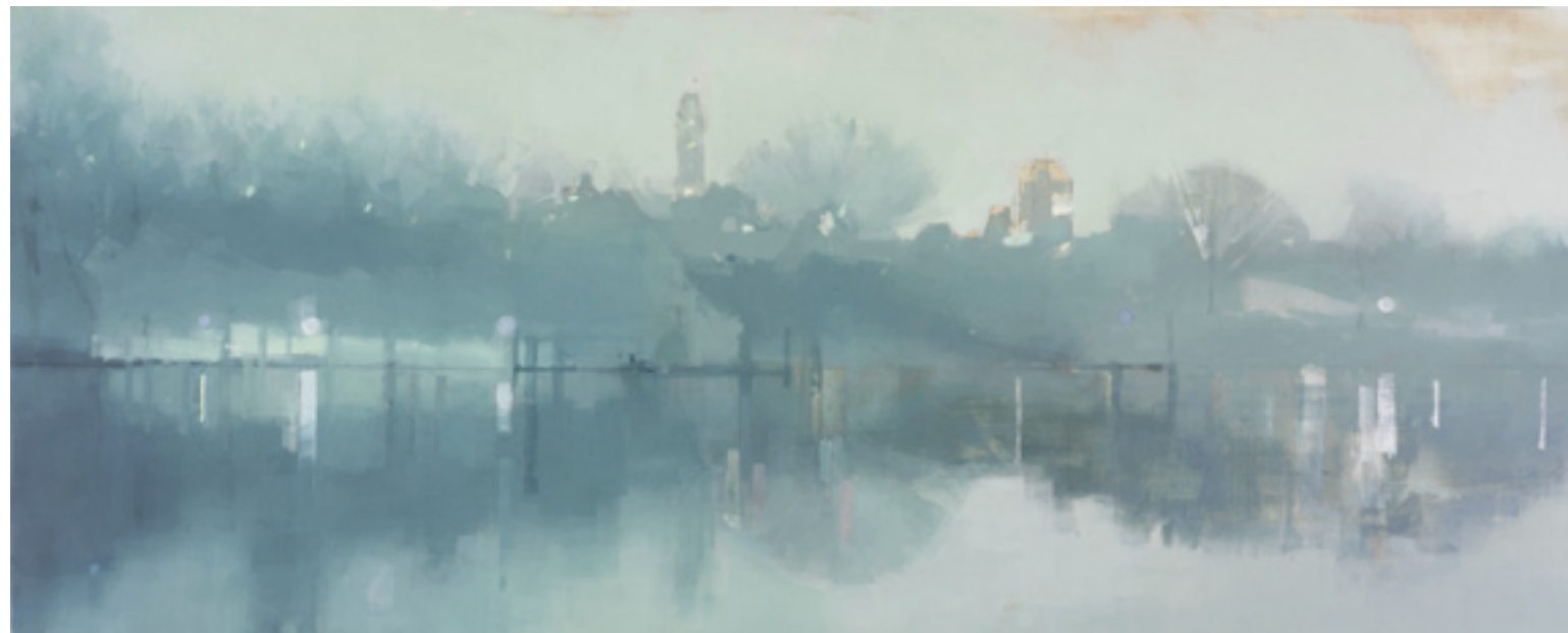
Central Park, Before Dawn, 2010 , Oil and pencil on panel, 20 X 50 inches

In oils, watercolors and monotypes, this artist conveys her unique vision of the world.