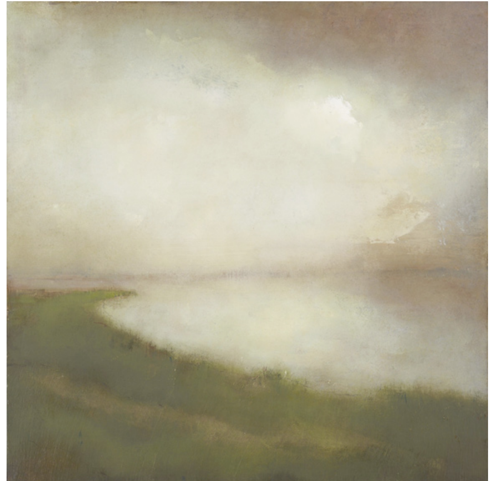
Island Bay 2, 2005 , Oil on panel, 20x20 inches