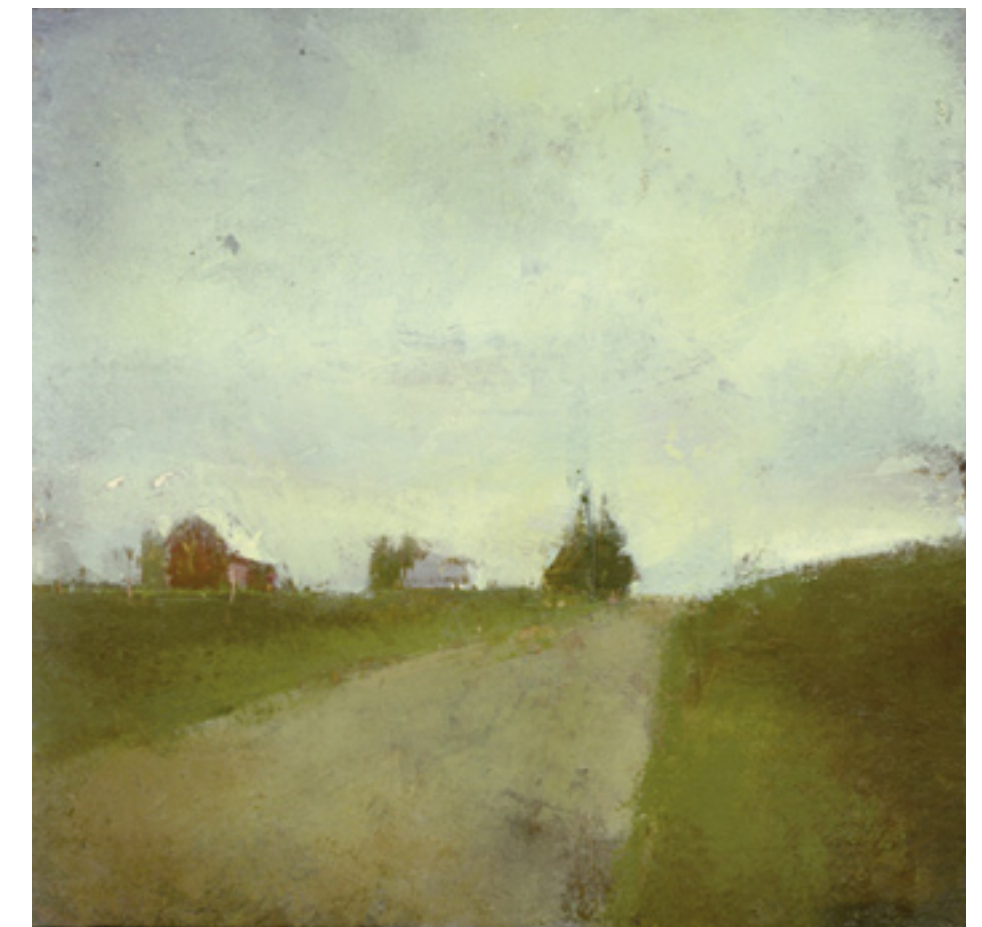
Heartland, 2005 , 8 X 8 inches, oil on panel