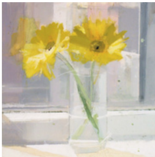
Flowers in a Glass 3, 2010 , Oil and pencil on panel, 12 X 12 inches