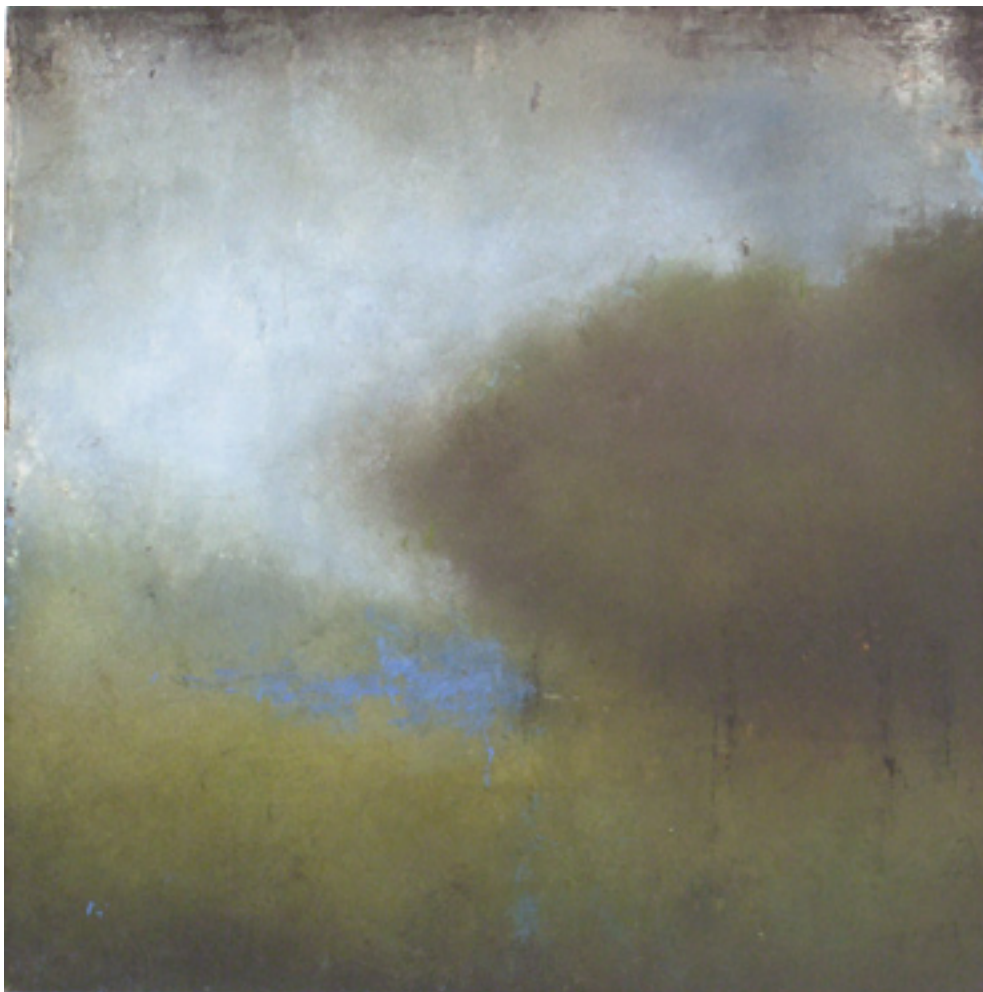
Meadow #2, 2003 , Oil on Panel, 10 X 10 inches