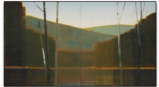
2016, XLI 2016 48 x 86 in, oil on birch panel