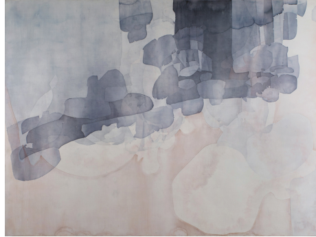
Untitled No. 686, 2013 Ink, silk, and beeswax on panel, 53 x 71 inches

November 14-December 21, 2013 Artist Reception, Thursday, November 14, 6:00-8:00pm