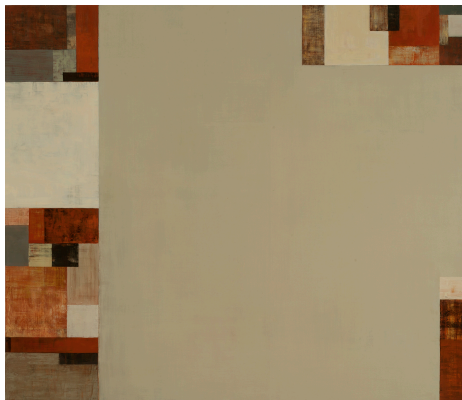
Broadway 93 / Dance with Me, 2012