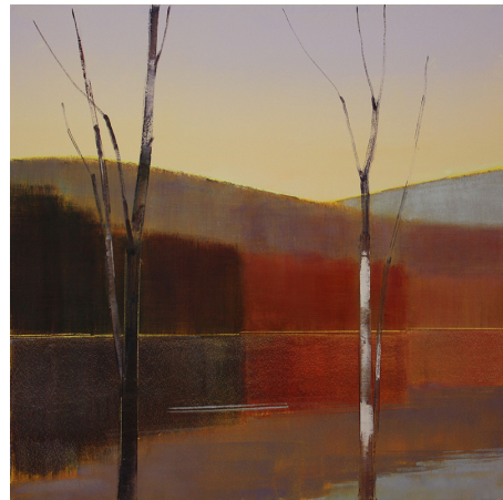
2014, X.V., 2014, Oil on panel, 36 x 36 in.

Stephen Pentak's formative work explored abstraction, though it was always informed by nature. His highly developed, mature style now depicts landscape with particular attention given to composition. The underlying structure lends a grounded tranquility to his imagery. Pentak continues to expand on his extended series of landscapes, creating a rhythmic sense of space between the middle ground and foreground.