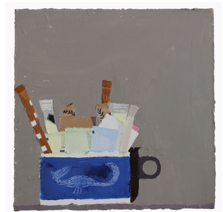
"Still Life with Sugar Packets and Cup # 1," 2015, Oil on linen, 12 x 12 in.